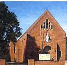
St. Malachy's Gooloogong