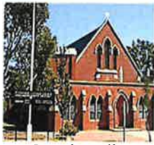
St. Edward's Canowindra