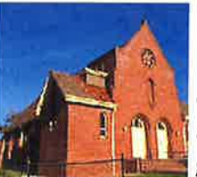
St. Brigid's Woodstock