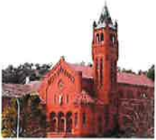
St. Raphael's Cowra