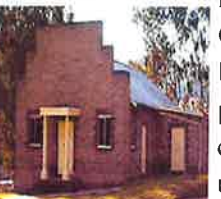
St Vincent's Wyangala