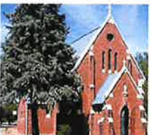
St. John the Baptist, Eugowra